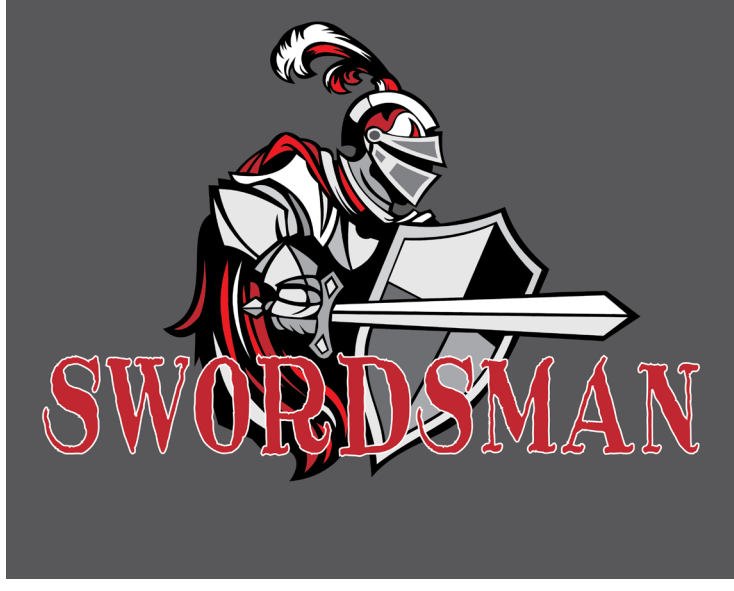
Revised 1/19/2021 *Consult the Uniform Guide for placement on the Royal Rangers Uniform